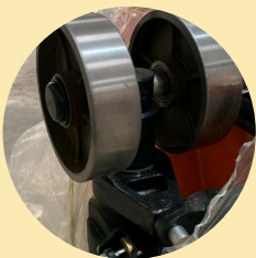
Heavy Metal Wheel