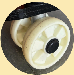
Nylon White Wheel