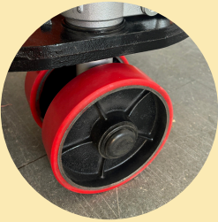
PU Red Wheel